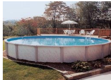
EXAMPLES OF APPROVED ABOVE-GROUND POOLS