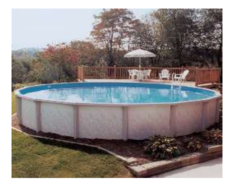
EXAMPLES OF APPROVED ABOVE-GROUND POOLS