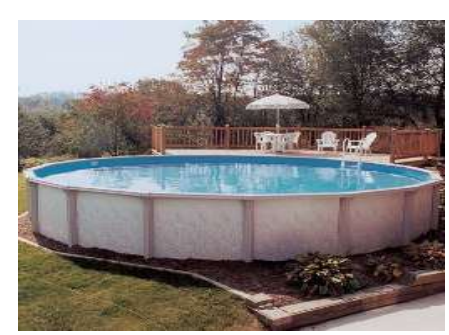
EXAMPLES OF APPROVED ABOVE-GROUND POOLS