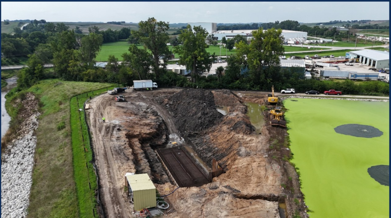
A different view overhead